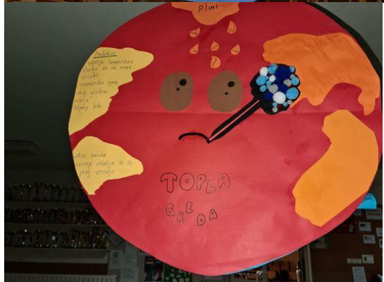
In 1st grade we watch cartoon Wall-e who shows our future if we won't take care of our planet. It is a shocking story which made children think. Children did work on drawings how do they see the world in the future.