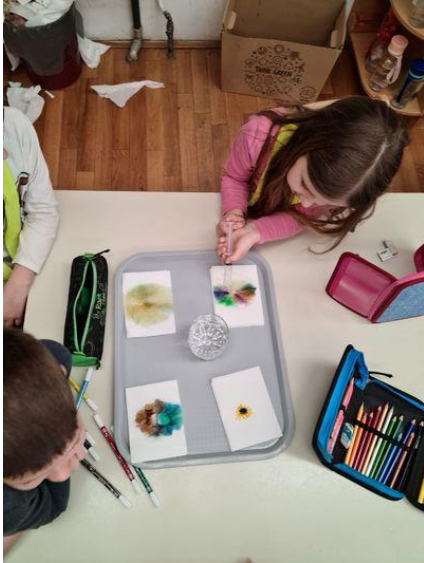
We discovered what components mixes with the water into united liquid.